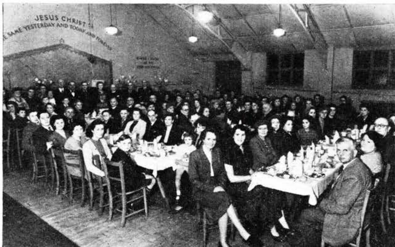
Re-opening celebration at Reading

LURGAN. —The church has been repaired and completely replastered. Reports from the annual fellowship meeting show that during the year there have been a number of conversions. Thirty new members were received into fellowship and forty people baptised in water. A number have recently been baptised in the Holy Spirit. A monthly day of prayer and fasting for the deepening of spiritual life and for revival has been started.