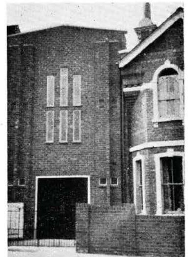
The new Front