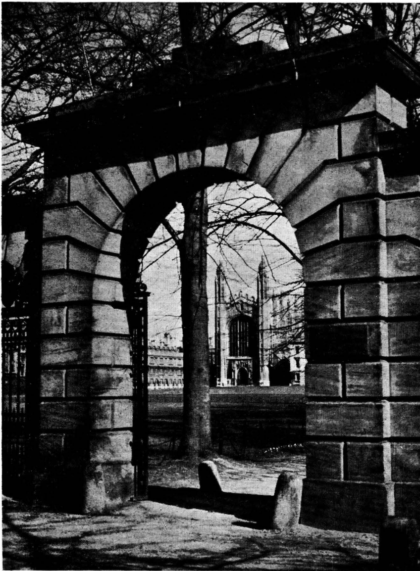
King's College, Cambridge