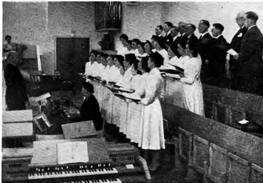
Singing in the lovely Smyrnakyrkau, Gothenburg.