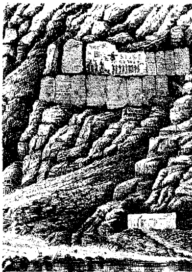
ROCK OF BEHISTUN.

One of these inscriptions, at an elevation of 500 feet from its base, was by Darius, and just as the Rosetta Stone provided the key to understand the Egyptian