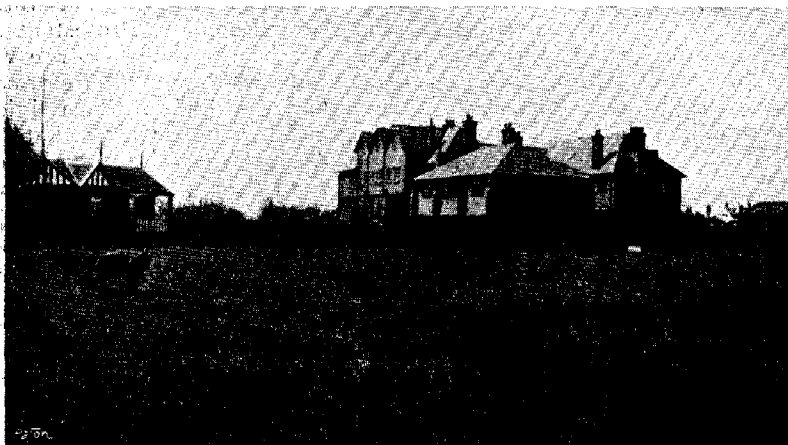
The above is a picture of the house taken for an Elim Holiday Home at St Annes-on-Sea.

A lead one way or the other from this country will have world-wide influence. Oh that that influence might be for godliness! That from this beloved land there may flow rivers of divine life, that will refresh men of every land. England has become the leading nation, and the nation with the clearest moral record and influence because of the power of the gospel which has been preached here as in no other land. And this gospel is contained in the "Protestant Reformed Religion" which our King promises to uphold. As never before, we pray that he, and his gracious Queen, may be led of God to understand the full import of the most sacred vow of their enthronement, and give a lead to this nation which will, as the apostle prays for in I. Timothy ii., result in a true revival of pure religion.