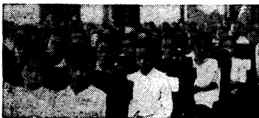
QUEENSTOWN SCHOOL, BRITISH GUIANA.

A new native catechist teacher has been appointed recently at our Mission Station in Guiana—at a salary of £30 a year. Promises to support him for 7, 10, 14, or 21 years are earnestly invited. We are anxious to see his work established on a firm basis.