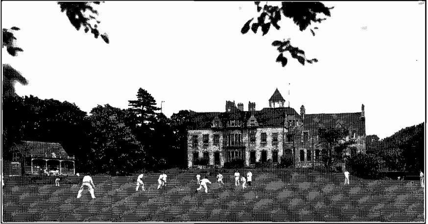
"ST. DAVID'S," REIGATE