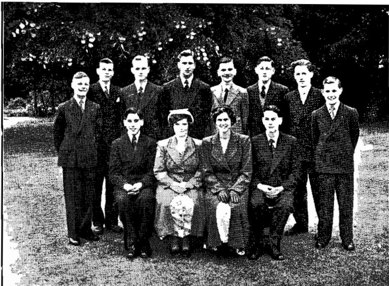
LEAVING REIGATE, 1952.