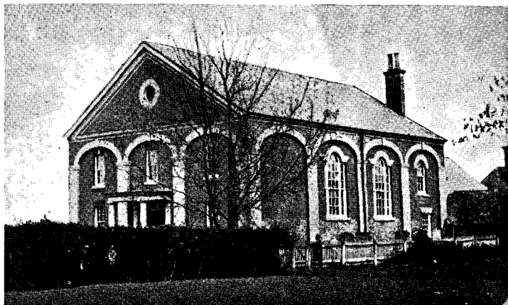
BAPTIST CHAPEL, From the south-west.