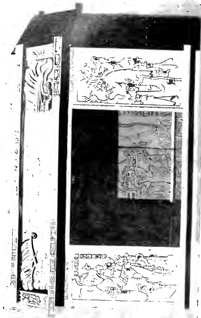
FIG. 5.—THE SANCTUARY OF A TEMPLE OF THE SUN IN PALENQUE, AFTER STEPHENS AND CALDERWOOD.