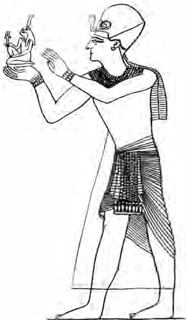
FIG. 6.—BAS-RELIEF OF SETI I PRESENTING THE FIGURE OF TRUTH TO OSIRIS, FROM THE TEMPLE AT ABYDOS.