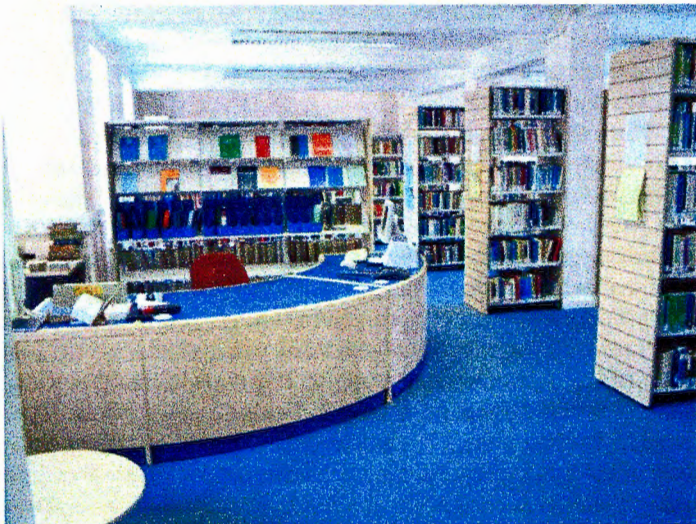
The interior of the new library based at Burgate House, The Precincts, Canterbury.