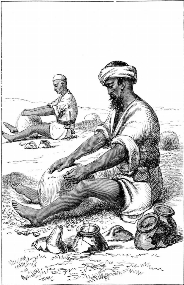
FELLAHS SHIVERING POTTERY.