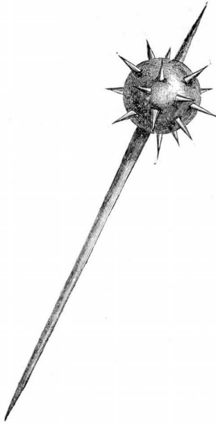
A DERWEESH'S IRON MACE.