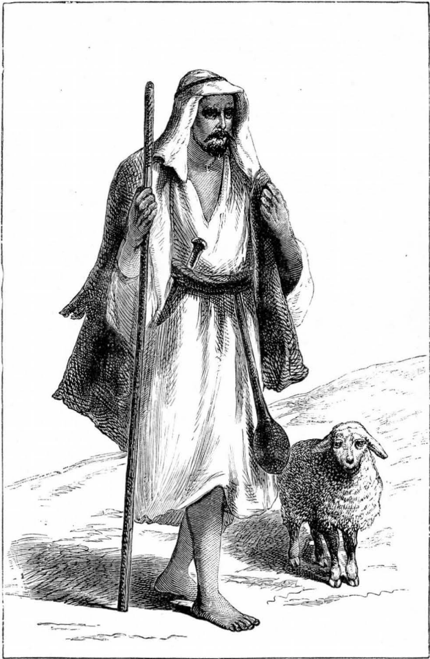
THE SHEPHERD'S CLUB AND STAFF.