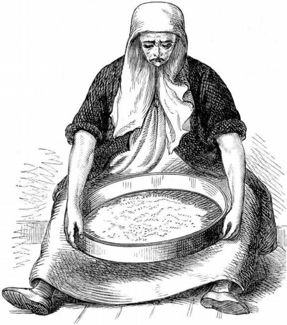
A BETHLEHEM WOMAN SIFTING WHEAT.