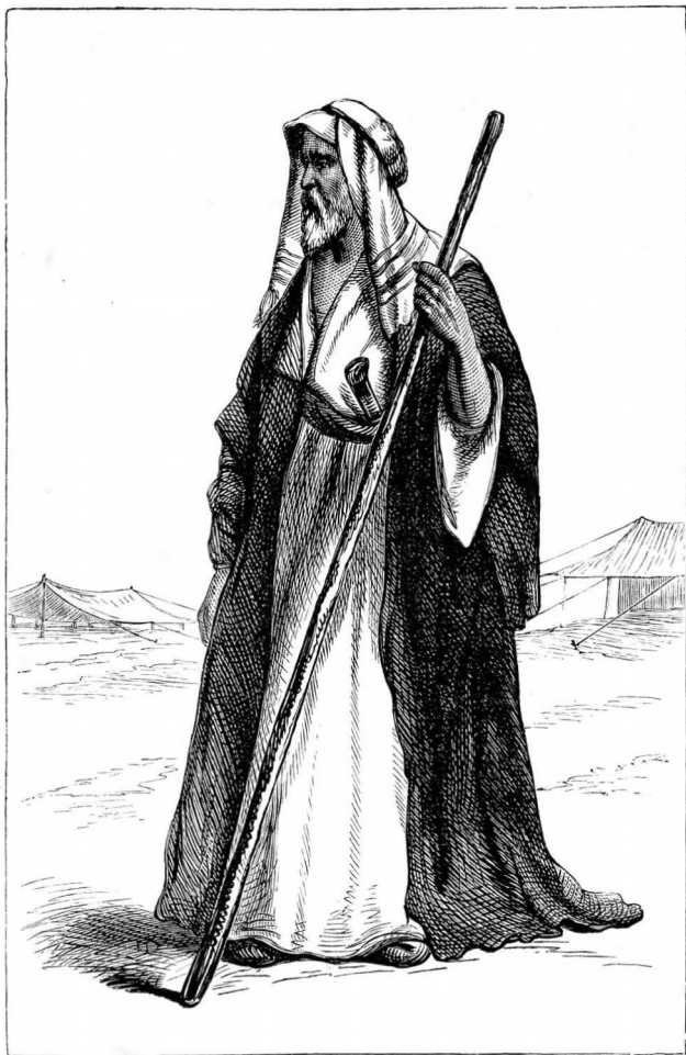
AN ARAB SHEIKH LEANING ON HIS STAFF.